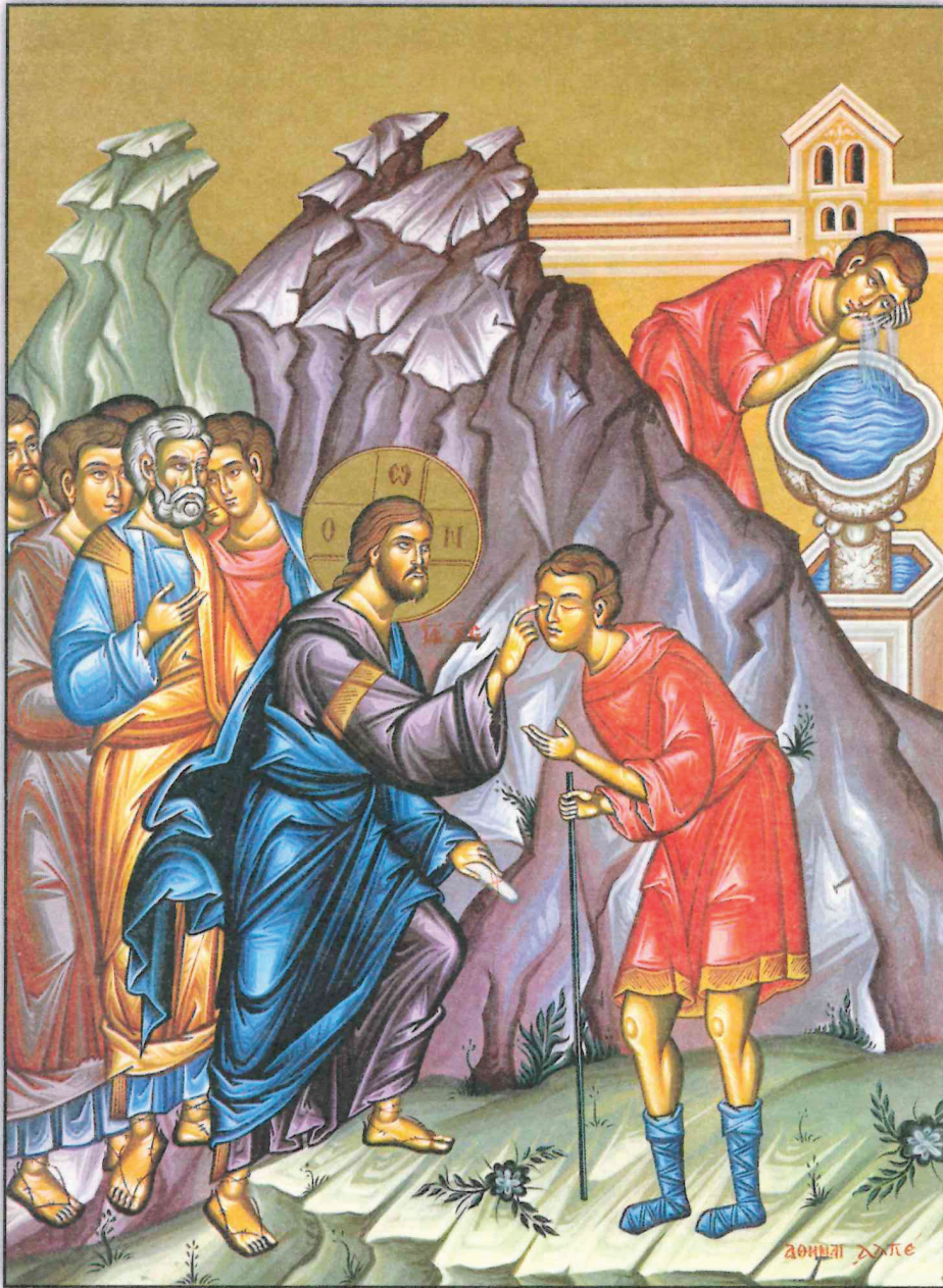
Icon of the Gospel of the Man Born Blind