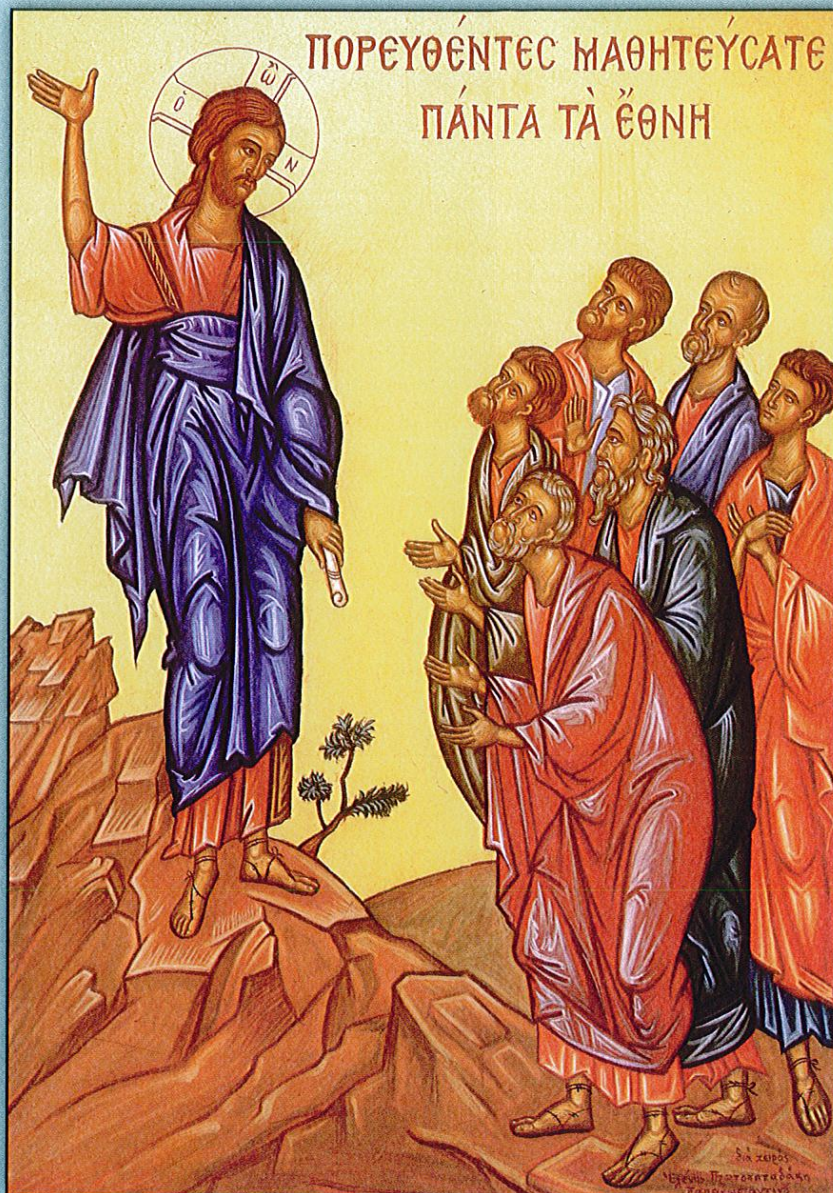
Icon of Christ Teaching on the Mount